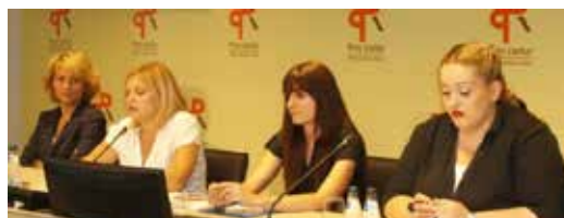
Press conference, Podgorica, July, 2011.