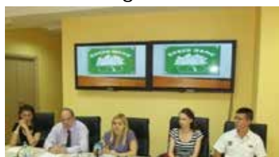
Press conference, Podgorica, July 2011.