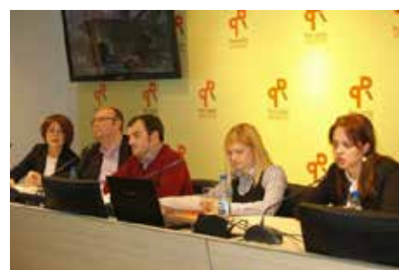
Press conference, Podgorica, March, 2011.

Improvement the protection of biodiversity through the empowerment of the Skadar Lake cross-border cooperation between Montenegro and Albania in order to promote the Lake as a potential biosphere reserve - UNESCO protected area, in the frame of Man and Biosphere programme.