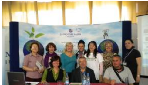
Participation of the N2IC at 17th Ecology fair, Budva, April 2011.

Released a regional competition for small grants program on "Environmental protection and rational use of energy" and evaluated six successful grant proposals out of eight proposals in total received;