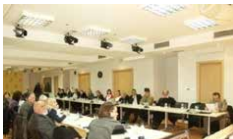
Round table, Podgorica, November 2011.

Developed quantitative and qualitative research processes of public consultation and participation of civil society in the planning process for the potential construction of the hydropower dams on the Moraca River;