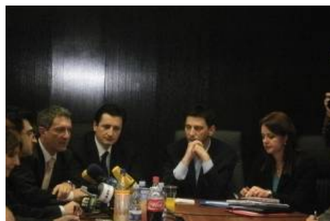
Preparatory meeting of the Environmental Forum, Podgorica, September 2011.