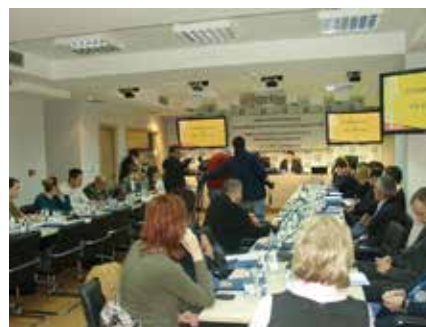
Regional Conference, Podgorica, December 2011.

Conference was supported by Konrad Adenauer Stiftung Foundation, office in Podgorica.