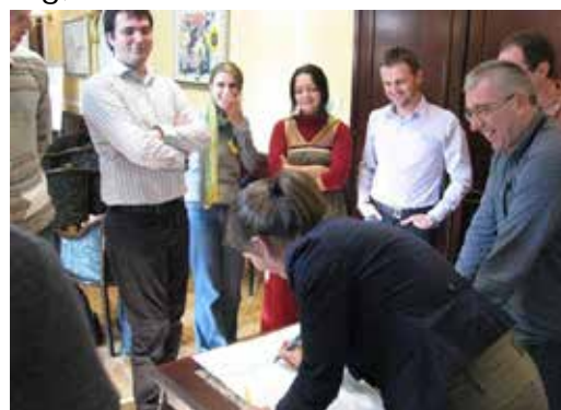
Training, Podgorica, November, 2011.