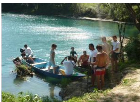
Cleaning activity, Danilovgrad, August, 2011.