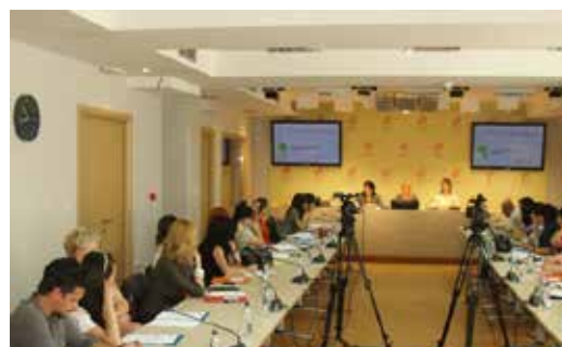
Workshop, Podgorica July 2011.

Encouraging of sustainable spatial development principles implementation and environmental protection in spatial planning documents in Montenegro.