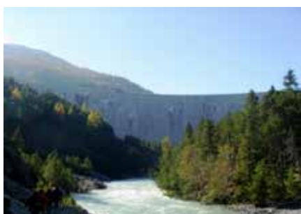
Study visit, Spool River, NP Zarnez, Switzerland, October, 2011.