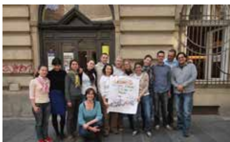
SEA Change workshop, Belgrade, April 2011.