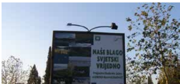
Billboard, boulevard Svetog Petra Cetinjskog, Podgorica, November 2011.