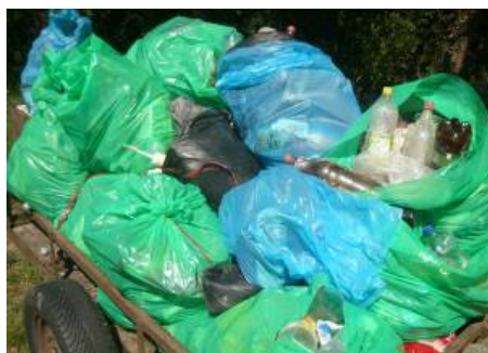
Waste extracted from the River Zeta, August 2011.