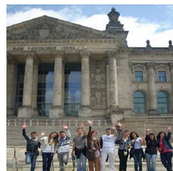
Travel to Europe, Berlin, July 2011.