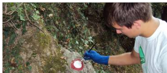
Marking the paths in park forest Savina, Herceg Novi, September 2011.

The project was implemented by Green Home, Young Researchers of Serbia and WWF and supported by the European Commission, within the programme Civil Society Facility.