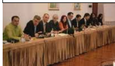
Regional Conference, Becici, February 2011.

The project is implemented in partnership with eight representatives of the non-governmental sector from the region: Co - Plan (Tirana), Centre for Ecology i Energy (Tuzla), Advocacy Training and Resource Center (Pristina), Macedonian Green Centre and 4x4x4 Balkan Bridges (Skopje), Green Home (Podgorica), Centre for Modern Skills (Belgrade) and Environmental Ambassadors from Belgrade, as regional coordinator and supported by Government of the Kingdom of Netherlands.