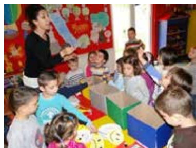
Workshop in kindergarden, Podgorica, May 2011.

NGO Green Home supported a campaign “Ecological thread that connects us” organized by Ministry of Tourism and sustainable development, throughout organization, preparation and holding educational workshops in schools and kindergartens. Beside organization of events, in frame of the campaign, Green Home donated funds for five non-governmental organizations to implement activities.