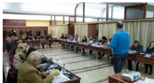
Workshop, Cetinje, November 2011.

The project was implemented in cooperation with the Institute for Nature Conservation in Albania and Trans-boundary Forum of the Skadar Lake, supported by the Delegation of the European Union to Montenegro and Albania in the frame of IPA Cross-border program Albania - Montenegro 2007-2013.