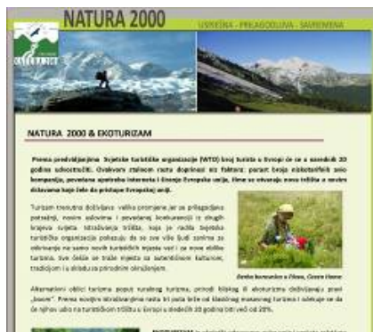
Informative brochure Natura 2000 and Ecotourism, Podgorica, September 2011.