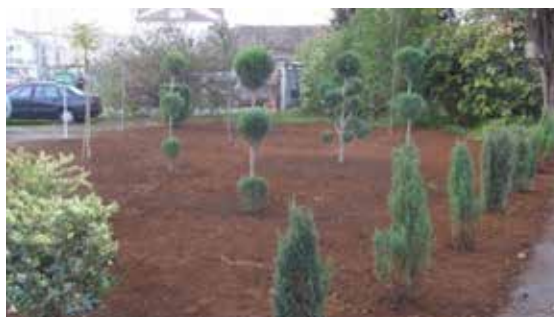
Crnogorskih Serdara Street after the planting activity, Podgorica, November 2011.