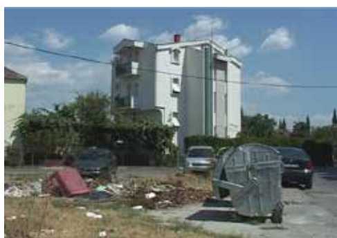
Crnogorskih Serdara Street, before the planting activity, Podgorica, August 2011.

The project was implemented in cooperation with TV Vijesti, supported by the Embassy of the United States in Montenegro.