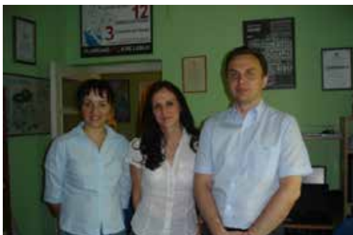
Initial meeting with NGO Ecologic, Podgorica, July, 2011.